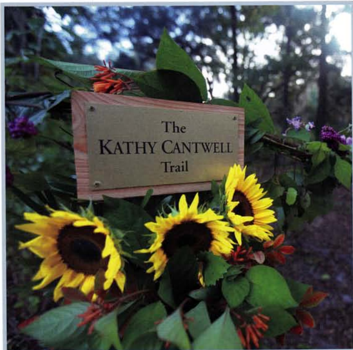
Entrance sign to the Kathy Cantwell Trail

The Cantwell Trail is almost completely shaded, and is open for hikers, bicyclists, and horseback riders. Parking is available at Witness Tree Junction (at intersection of CR 234 and CR 2082) or at Prairie Creek Lodge (7204 SE County Road 234).